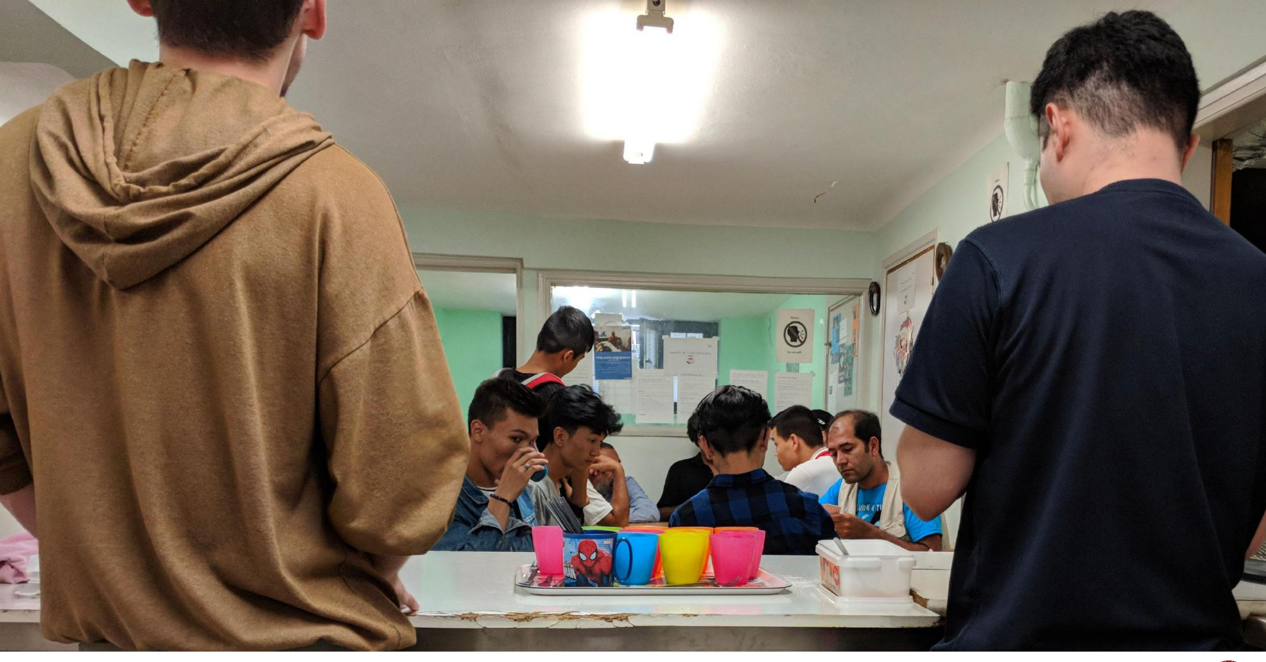
In 2017, two Afghan families hosted by JRS Greece started a daily event to help Afghan refugees and asylum seekers connect and ease their stress with tea, coffee, and table games.