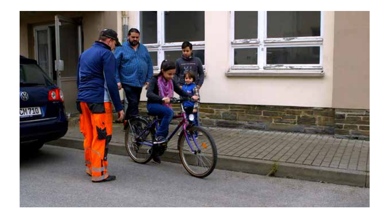
A girl tries out a bike that has just been repaired as part of an initiative in Plauen, Germany.

about the beneficiaries (refugees, asylum seekers, forced migrants), general characteristics of the host community (local citizens), and general characteristics of the CBI.