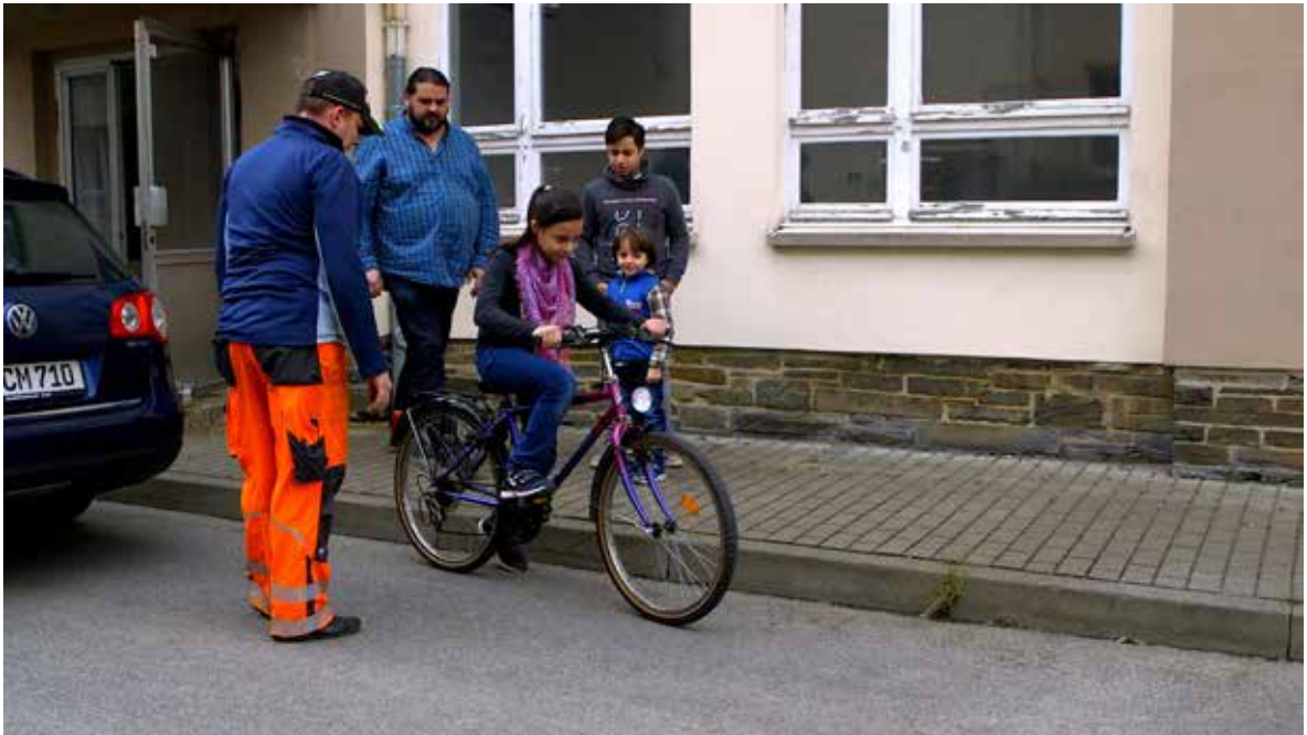
📷 A girl tries out a bike that has just been repaired as part of an initiative in Plauen, Germany.

about the beneficiaries (refugees, asylum seekers, forced migrants), general characteristics of the host community (local citizens), and general characteristics of the CBI.